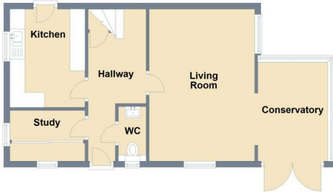
Ground Floor Approx. 49.3 sq. metres (530.2 sq. feet)